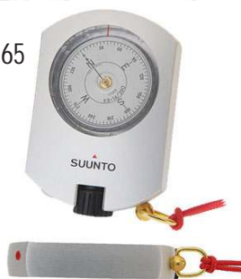
Compass Suunto Kb14