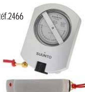
Clinometer Suunto Pm5