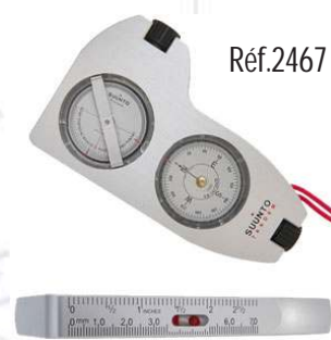
Tandem, Precision Compass And clinometer Suunto